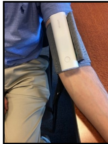
Figure 1. Wi-Fi Smart Blood Pressure Monitor